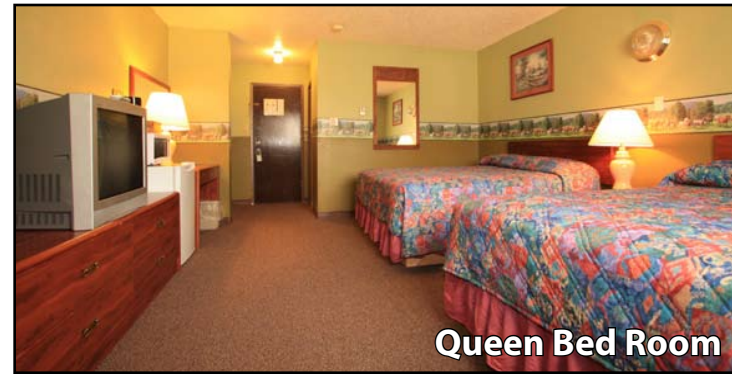
Queen Bed Room